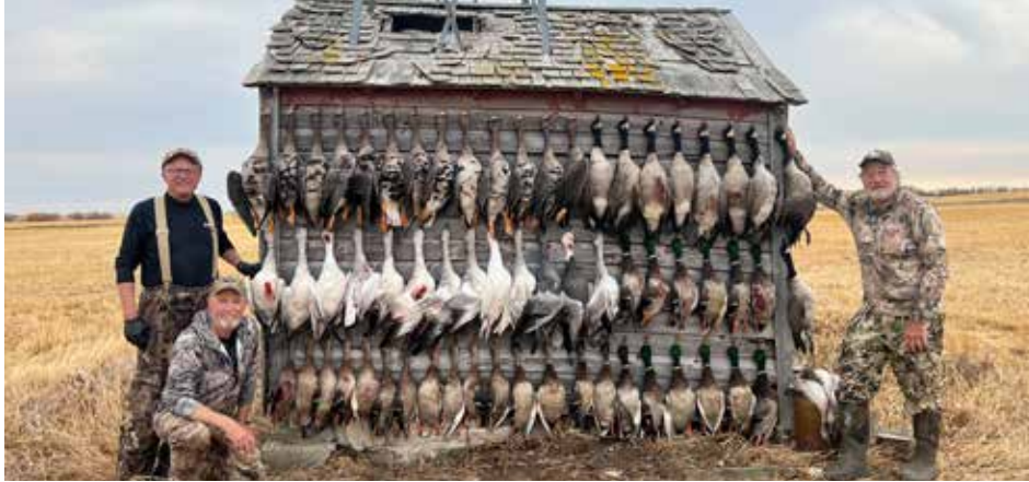
Ambassador Circle Hunt 2022